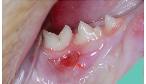
ULCER RESULTING FROM THE TRAUMATIC CONTACT OF THE UPPER TOOTH SEEN IN THE PHOTO ABOVE.

This can result in destabilisation of adjacent teeth or even perforation of the palate and communication between the nose and the mouth.