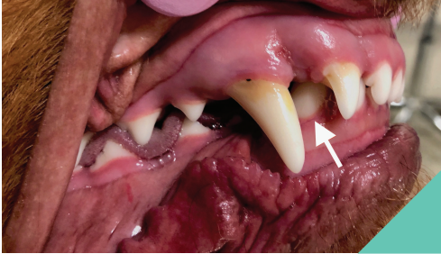
THIS DOG'S LOWER JAW IS TOO SHORT AND NARROW WHICH RESULTS IN THE LOWER CANINE TOOTH (ARROW) INJURING THE ROOF OF THE MOUTH.

The most common traumatic malocclusion that occurs in the dog results from the lower canine teeth digging into the soft tissues of the upper jaw or palate. This may result from a displacement of one or both lower canine teeth towards the tongue.