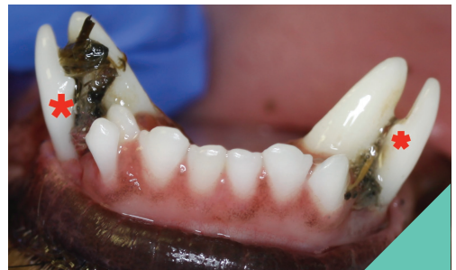
RETAINED DECIDUOUS CANINE TEETH (STARRED) HERE ARE STOPPING THE ADULT TEETH FROM MOVING INTO A NORMAL POSITION. ROTTING PLANT MATERIAL CAN BE SEEN TRAPPED BETWEEN THE PERMANENT AND DECIDUOUS TEETH.

The adult canine tooth is considered a strategically important tooth and has a number of important functions. Options for further treatment of maloccluded canine teeth include extraction, although this is a definitive treatment and is quite traumatic. Other options include shortening of the crown of the tooth, so that it doesn't injure the soft tissues, or movement of the tooth into a normal position.