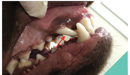
THE UPPER CANINE TOOTH HAS ERUPTED AT AN ABNORMAL ANGLE AND IS ROTATED (ARROW), PREVENTING CLOSURE OF MOUTH.

Cats are likely to develop growths of infected tissue at the site which they bite on every time they close their mouths, which can be extremely painful. Simple shortening of the tooth crown or tooth extraction is successful in managing this problem.